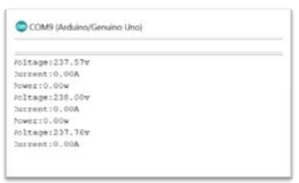
Output On Serial Screen